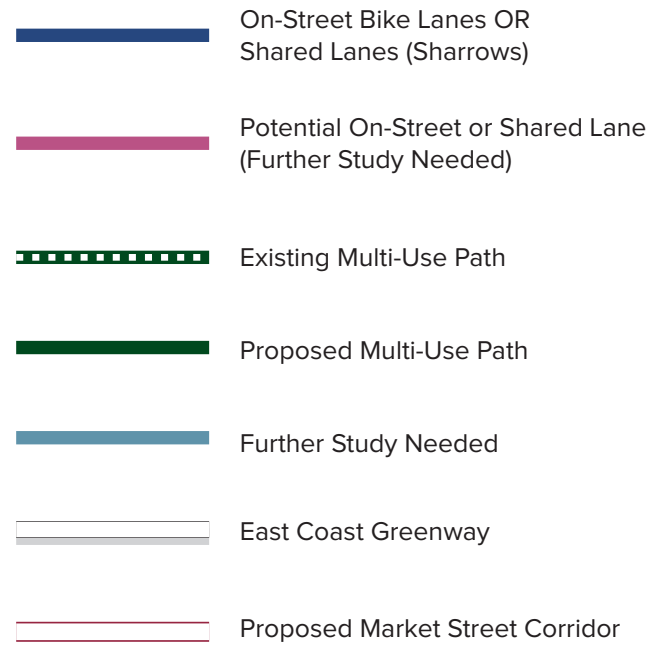
FIGURE 1. PROPOSED BIKE NETWORK