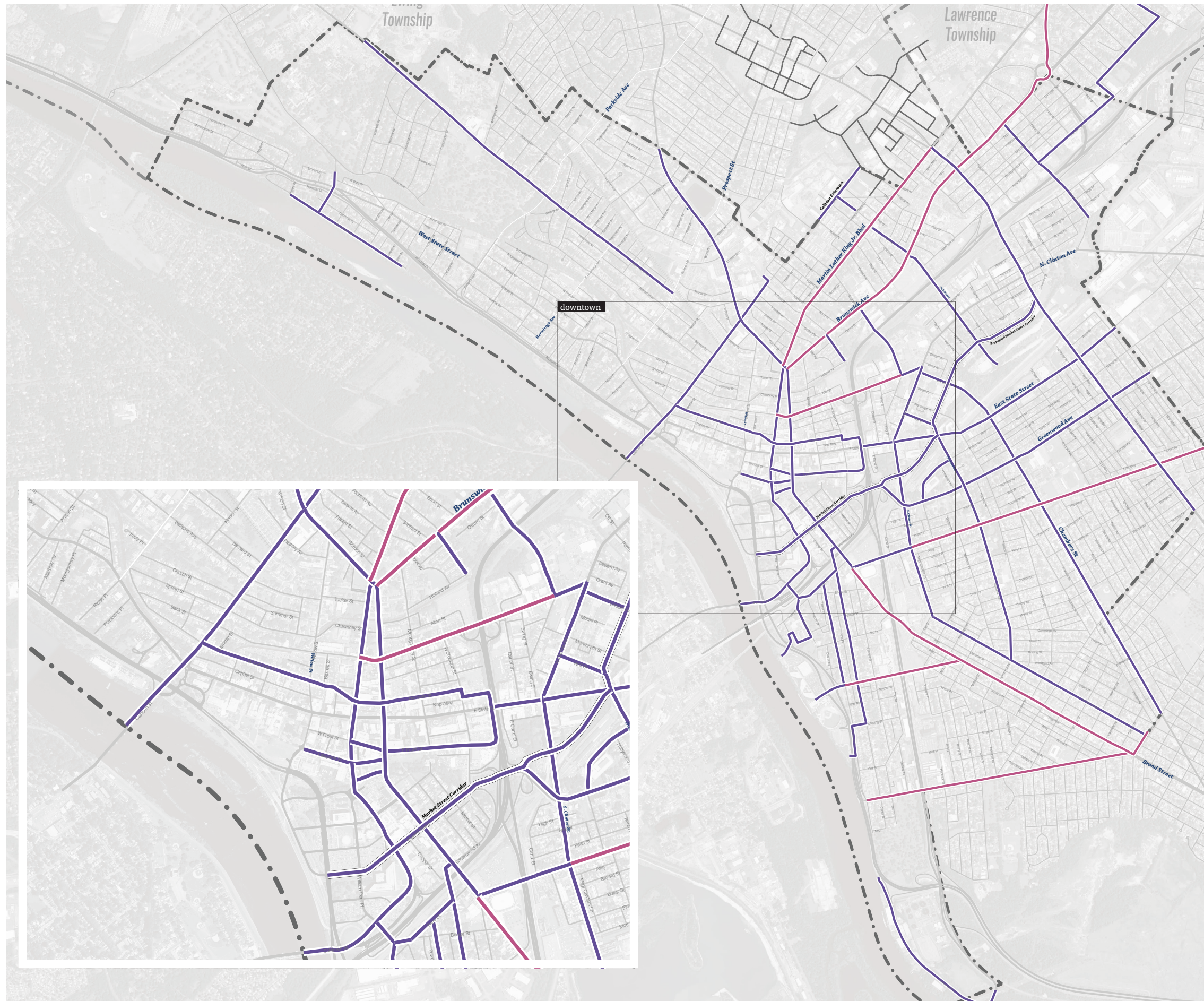
FIGURE 2. PROPOSED S MAP