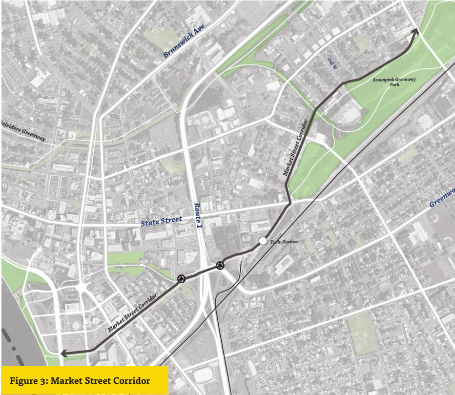
Figure 3: Market Street Corridor

Finally, the City must continue to advocate for the Waterfront Reclamation and Redevelopment Project that would turn NJ Route 29 from a limited access highway into a boulevard. The current NJ Route 29 would be re-designed as an urban boulevard that will move traffic efficiently, but at lower, safer speeds and allow the City to better connect to its the Waterfront.